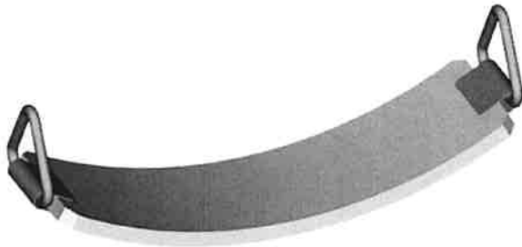
284, 2840 and 2841 Slashproof Seat