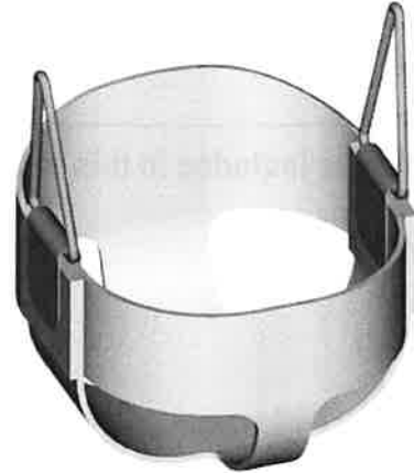
299 and 2990 360° Tot Seat